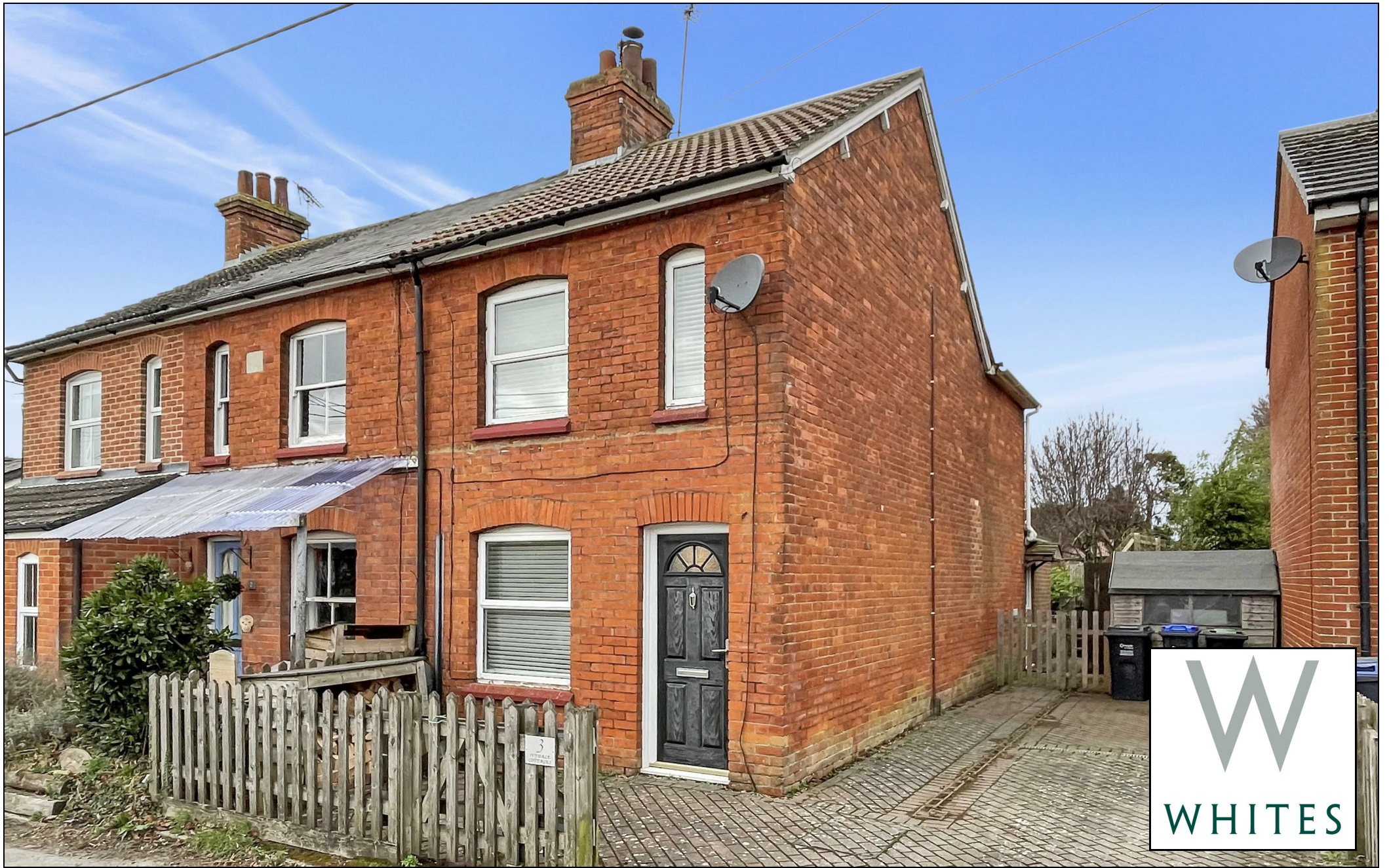
3 Ivydale Cottages Nett Road, Shrewton, Salisbury, Wiltshire, SP3 4EZ